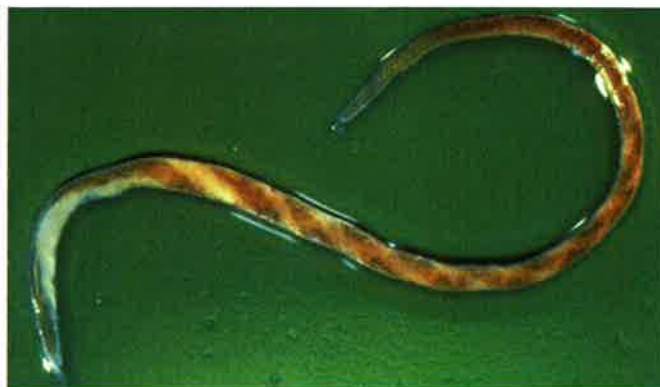
Barber pole worm

If you have any questions, please contact your local livestock agent.